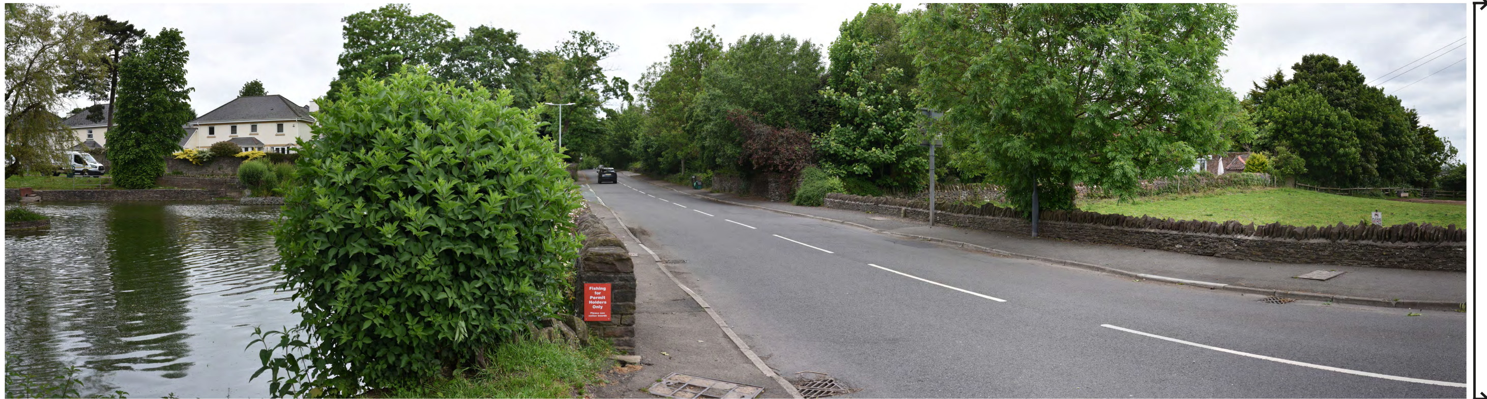
Strategic Viewpoint 30: Flax Pits Pond, Hicks Common Road