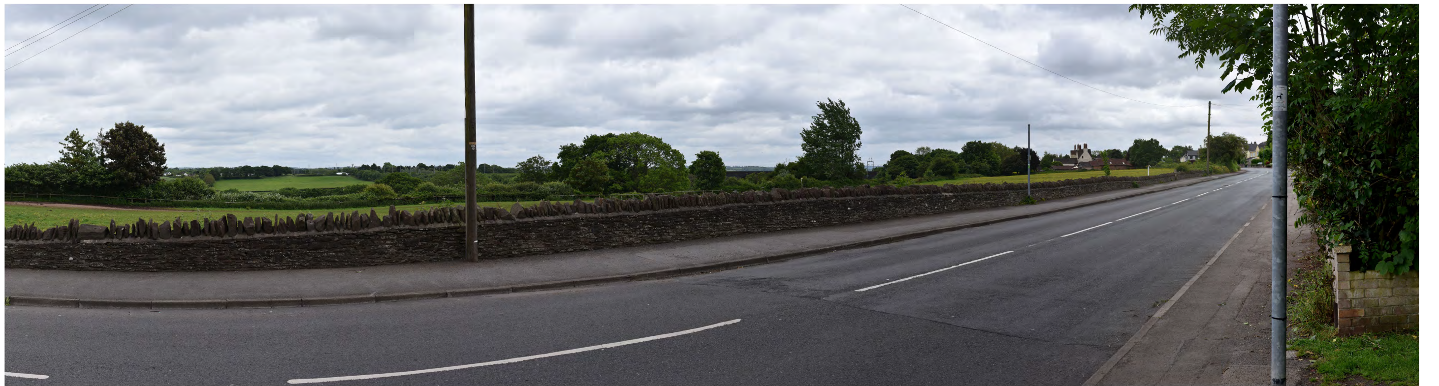
Strategic Viewpoint 30 (continued)