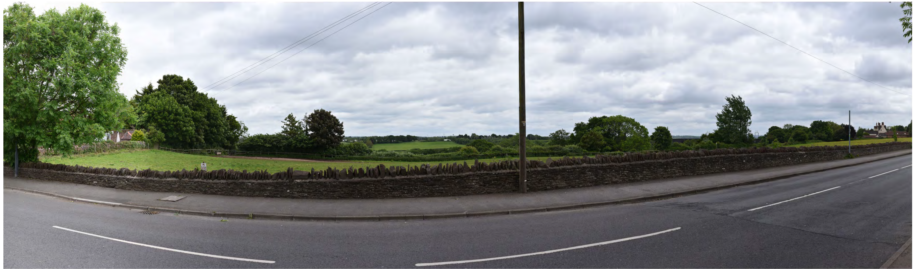
Figure 33.3: View Composition of Strategic Viewpoint 30